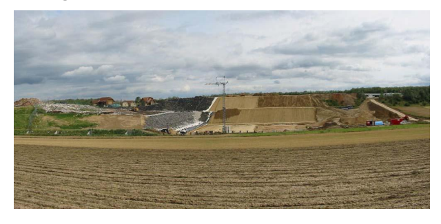
HYDRAULIC AND WATER ENGINEERING